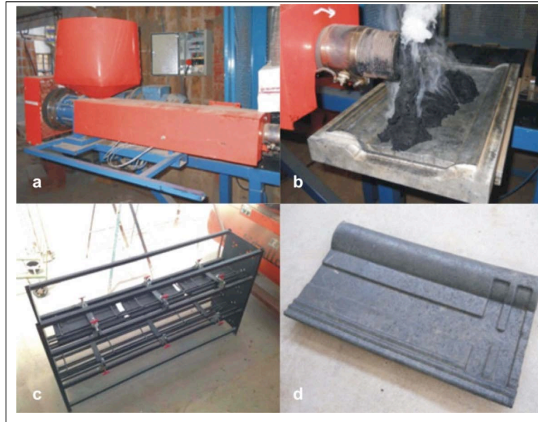
Figure 1. Manufacturing process of a recycled tile. (a) General view of the extrusion machine; (b) hot mix in the mold; (c) drying rack; (d) finished sample

the paste. Molding is performed for five minutes, during which the paste is hardened, thus maintaining the desired shape. The recently molded tile is put onto a rack, so that it will not deform while cooling. Then, the leftover material is trimmed off.