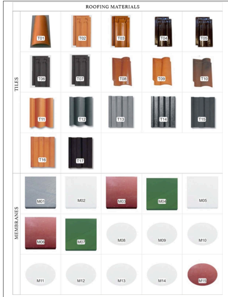
Figure 2. Images of evaluated roofing materials. Traditional clay and cementitious tiles (T01 to T16) and tiles with recycled composite (T17); aluminum and geotextile asphalt membranes (M01 to M07) and liquid membranes (M08 to M15)